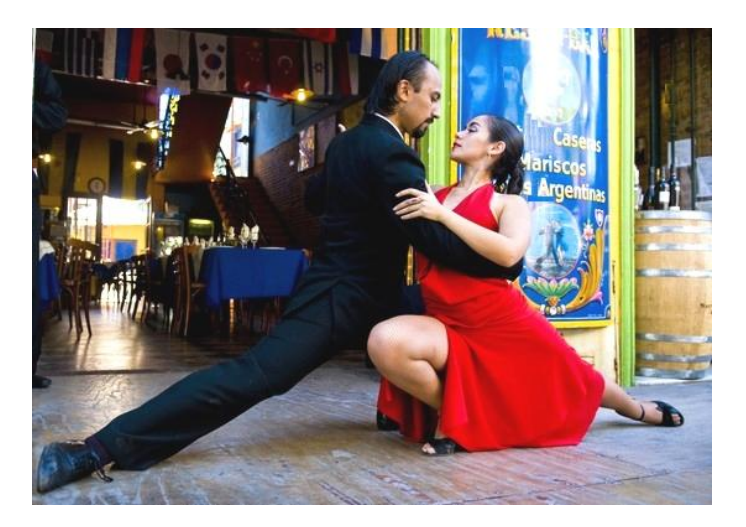
by the way, both women and men are always very well dressed. the women always wear high-heels shoes and dresses which allow the necessary movements, the man have a tie and often a hat.