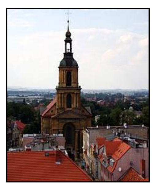
Protestant church "Maria Mutter der Kirche"