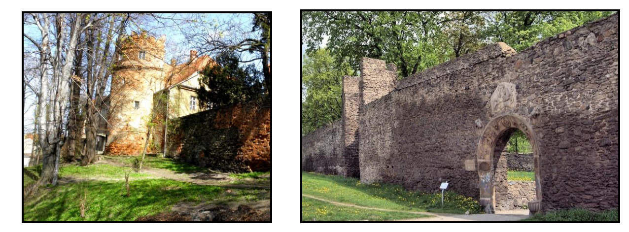
Old Citywalls - some on a slight hill (where B.R. 1944 learned skiing)