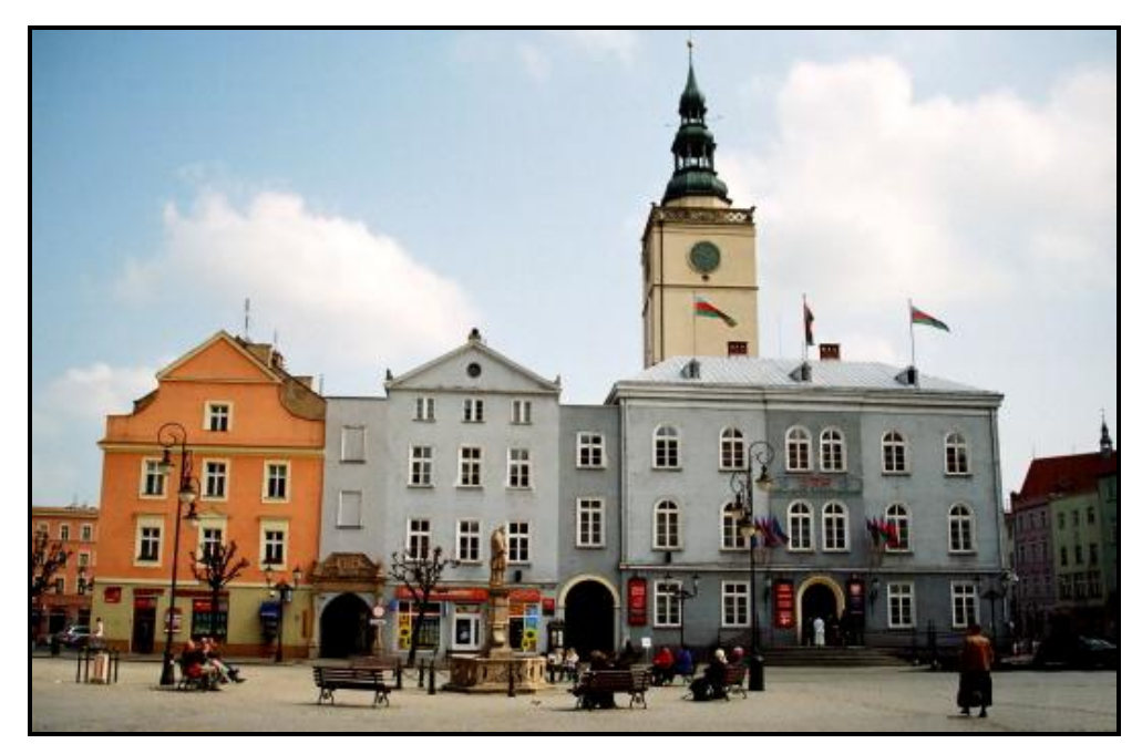
Central place & Townhall - Current view