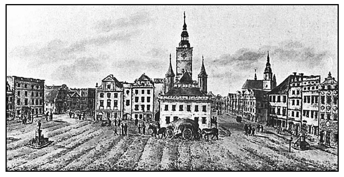
Central place & Townhall - Historic view